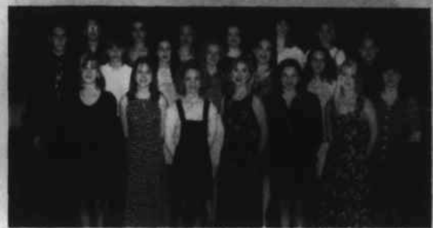
Old and new members of the Rice High School National Honor Society.